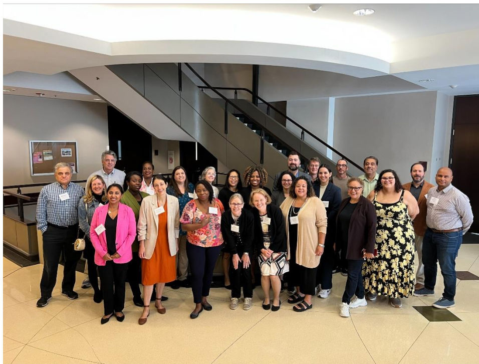
WIP Participants Gather at Loyola Law

The session brought together scholars and researchers from across the country with the aim of providing a collegial and supportive environment for advancing scholarship and promoting cross-fertilization between scholars working in related areas of the law. Scholars presented a wide range of topics that included children’s law, education law, and higher education law.